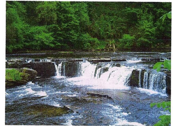
(Asgarth Falls – Remember Robin Hood Prince of Thieves??)